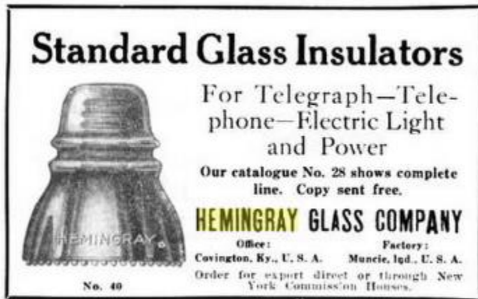
Exporters' Review, March 1914, p. 8.

ILLINOIS ELECTRIC PORCELAIN CO., Macomb, Ill. We manufacture all of the regular types and sizes of strain