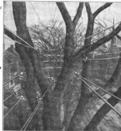
Car shows insulators installed in Arlington, Mass., by the Edison Electric Illuminating Co., of Peasee

Wire ties in solid to glass. Swinging arm allows for motion of tree. Glass screws on standard Locust Pins.